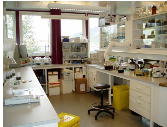
Our laboratory space