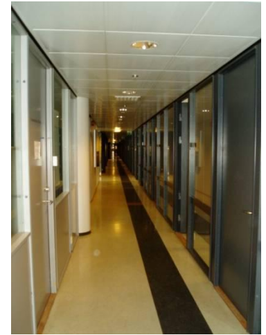
Coridor and offices