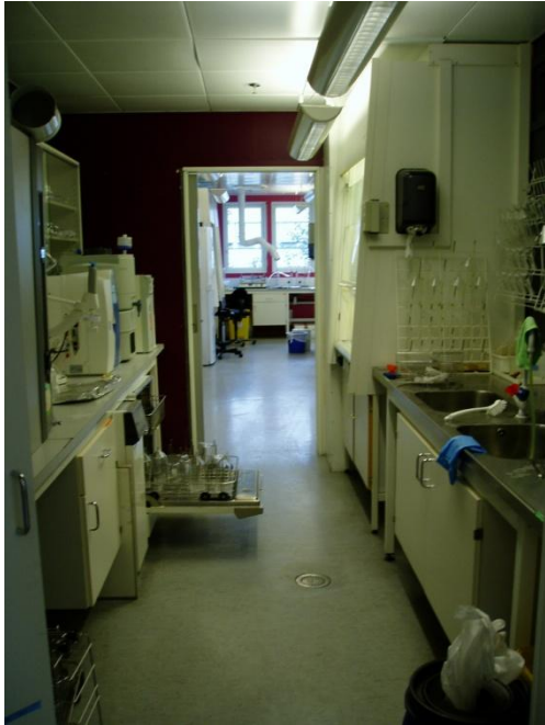
Washing and cleaning room